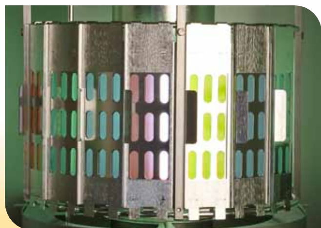
SEPAP MHE Specimen Rack

To simulate the effects of water, the SEPAP MHE+ is equipped with a specimen spray system.